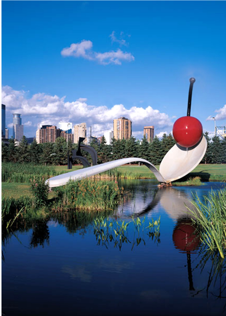
Spoonbridge and Cherry - Minneapolis Sculpture Garden, Walker Art Centre, Minneapolis (1988) by Claes Oldenburg and Coosje van Bruggen stainless steel and aluminium painted with polyurethane enamel (9 x 16 x 4 m)