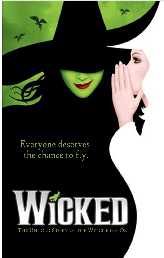
Wicked — poster for musical production (2003) designed by Serino Coyne, Inc

Read your selected question and the notes on the illustration carefully.