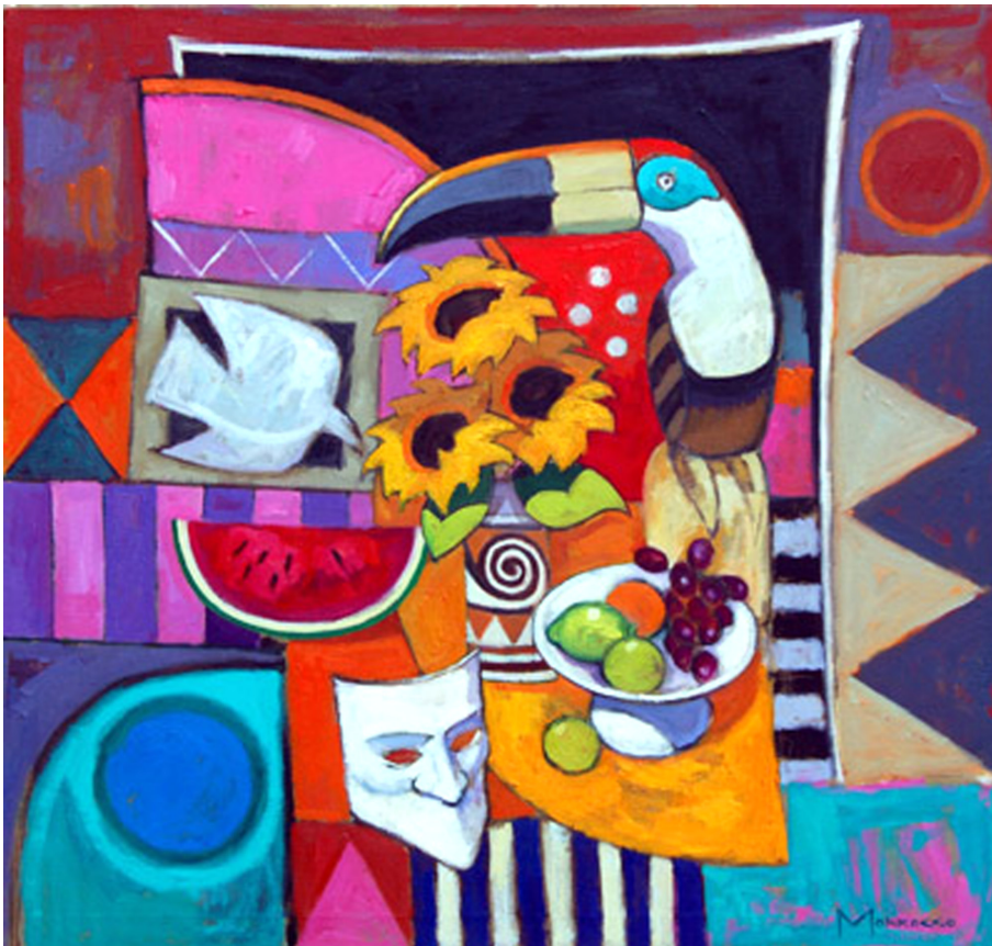
Toucan & Sunflowers (2007) by Jack Morrocco oil on canvas (86 x 91cm)