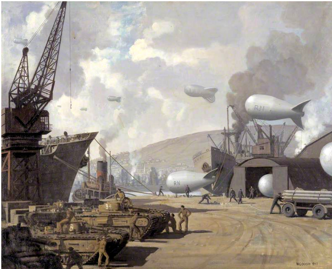
Swansea Docks in Wartime (circa 1940) by Walter Goodin oil on canvas (74 x 92 cm)