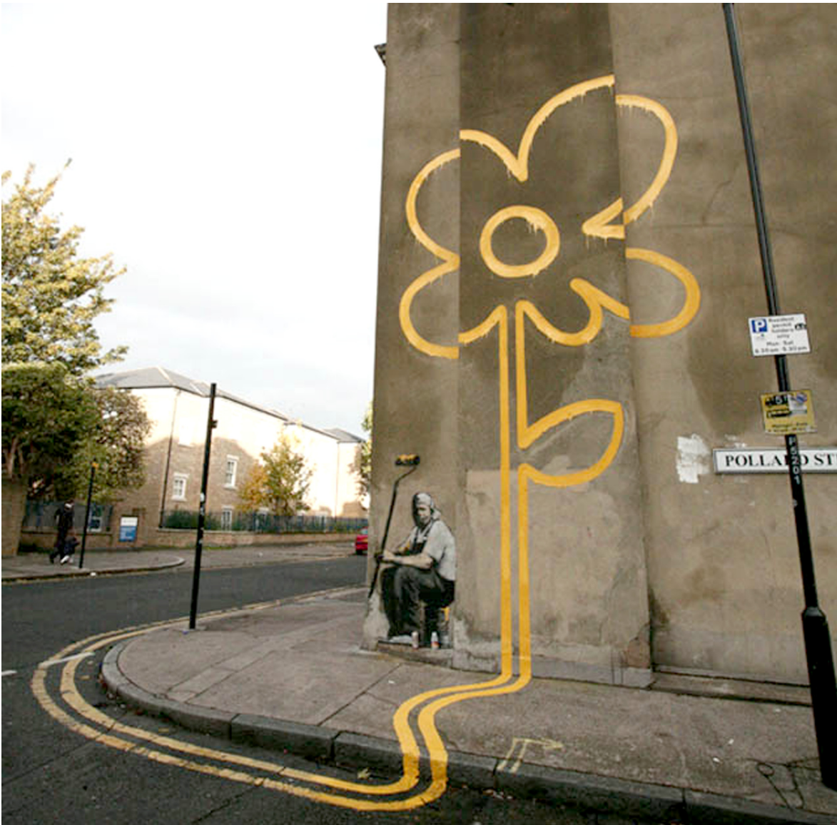
Yellow Line Flower (2007) by Banksy stencilling spray paint