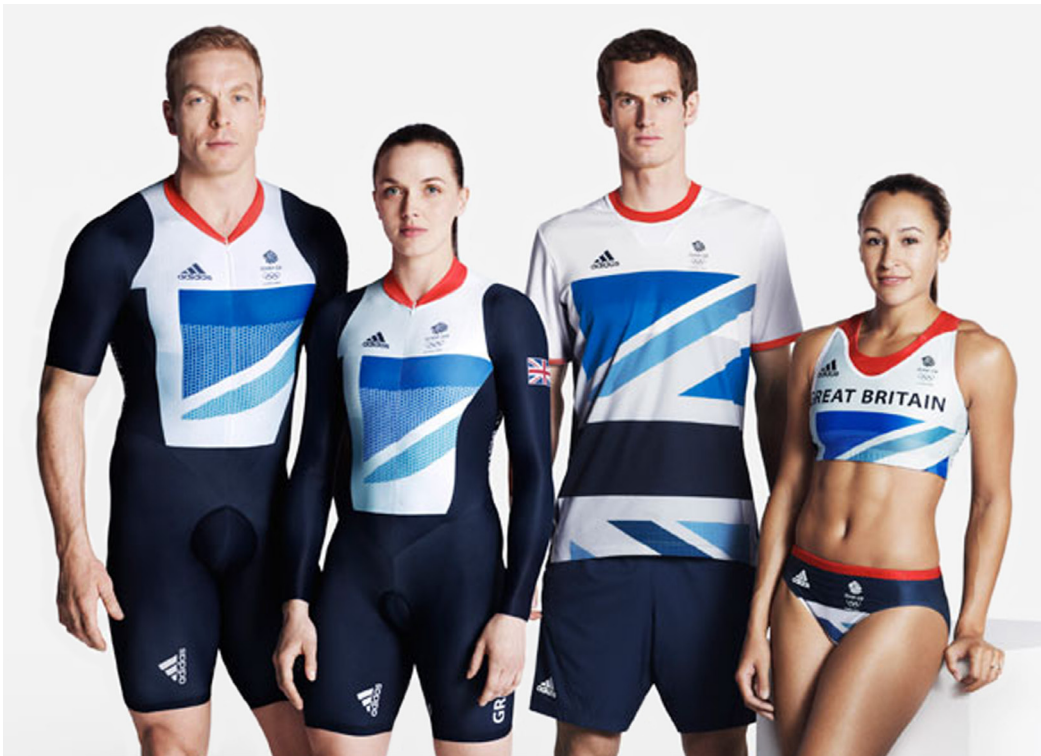
Adidas Team GB Olympic Kit (2012) designed by Stella McCartney

12. Style and function are important when designing sportswear. Comment on this range of designs. In your answer, refer to: