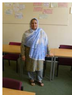
Name: Foursat Country: Afghanistan Nationality: Afghani