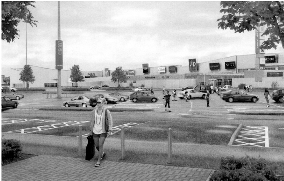
Adapted from HobbyCraft website