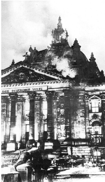
The burning Reichstag building

Goebbels informed Hitler that the Reichstag was in flames. The whole building was destroyed. Hitler blamed the Communists for starting the fire. He said that it was a signal from God. Hitler used that as an excuse to crush them with an iron fist.