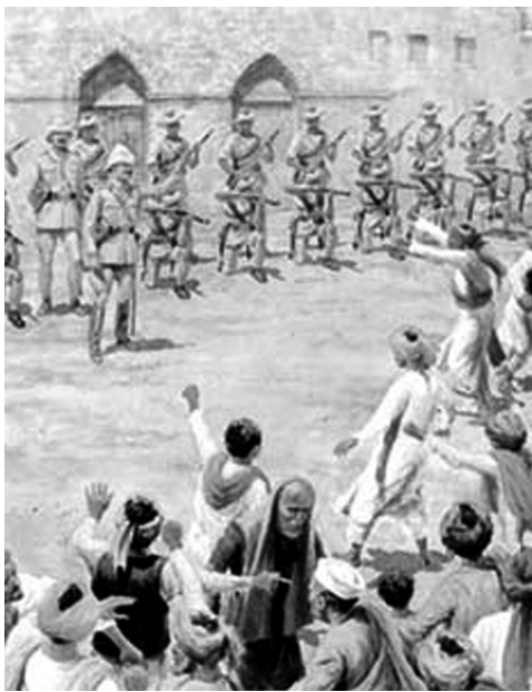
The British Army at Amritsar

The British Army fired without warning on 20,000 peaceful protesters in a walled garden at Amritsar. They continued firing until they ran out of ammunition. General Dyer was in charge of the operation which killed more than 300 people. Some time afterwards he was dismissed from the army and sent back home.