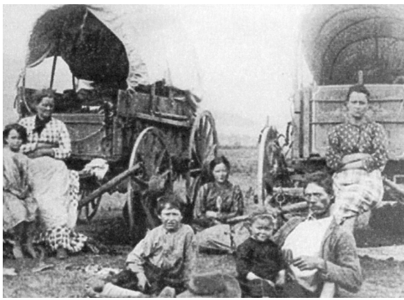
A group of emigrants beside their wagons

Because there was so little room inside the wagon, only the young, old or sick rode inside. Many enjoyed the adventure. There was also no room to sleep in the wagon at night, so the emigrants set up tents near their wagons. Native Americans would often trade with emigrants. Many oxen became weak and some died.