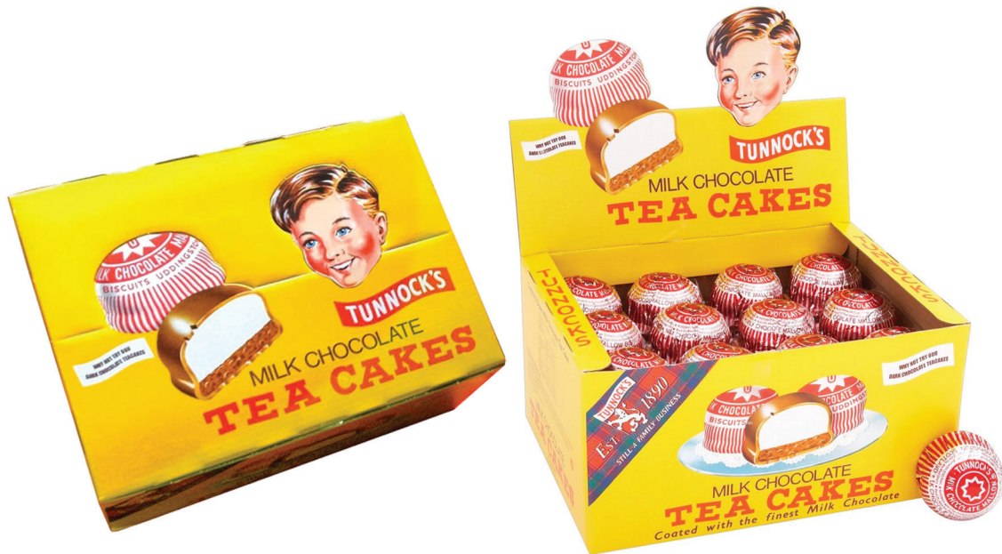
Packaging display box (1956-present) by an unknown designer printed cardboard (25 x 19 x 13cm)

8. Analyse the following elements of this packaging design: