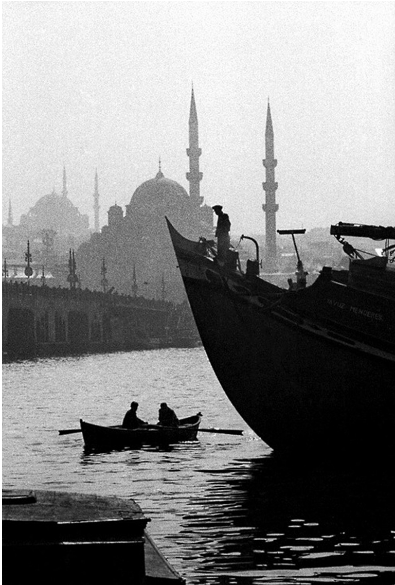
Istanbul (1959) by Ara Guler black and white photograph

3. Analyse the following elements of this photograph: