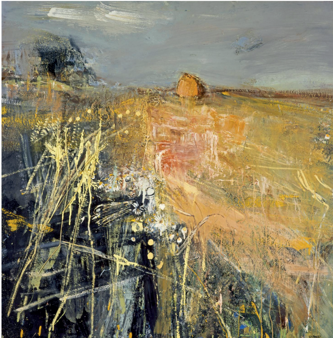
Summer Fields (1961) by Joan Eardley oil paint and grass on hardboard (106 x 105cm)

6. Analyse the following elements of this artwork: