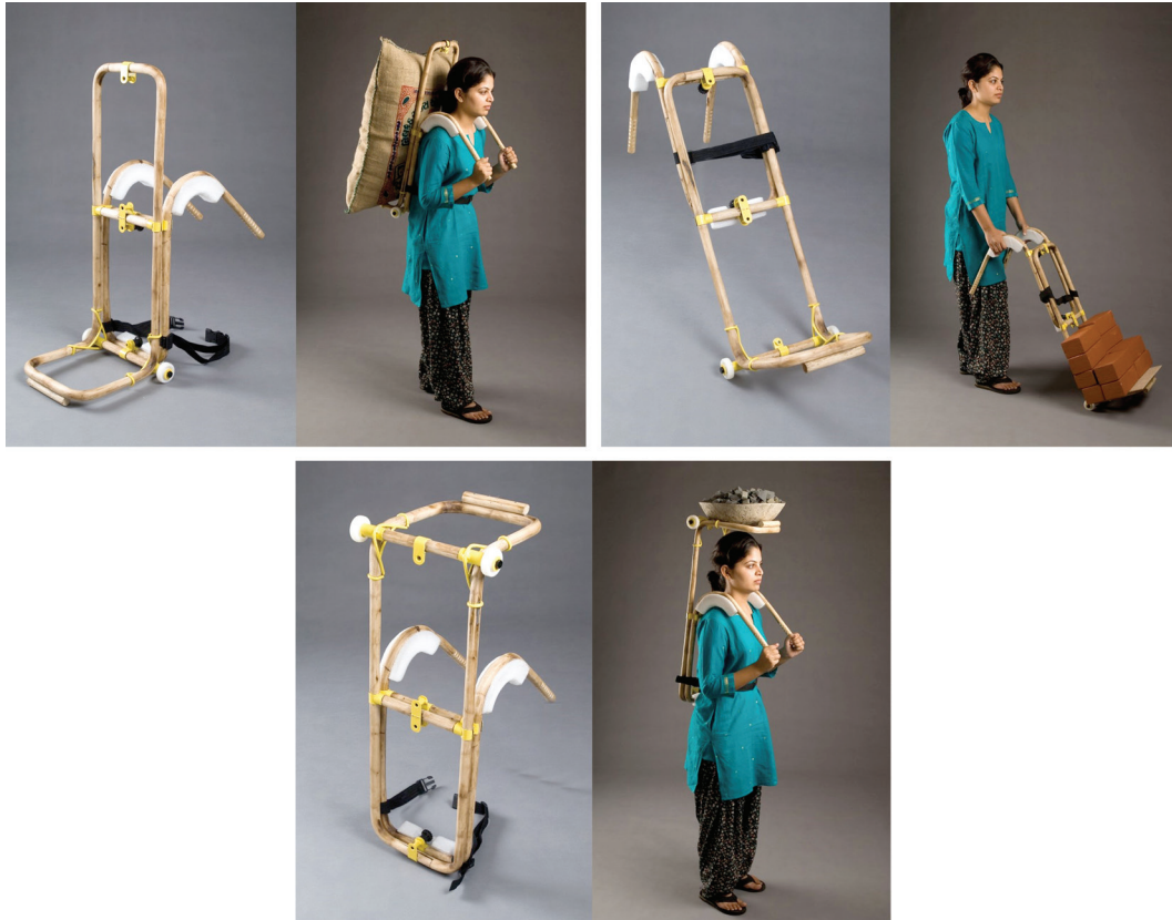
Load Carrier for Labour (c.2013) by Vikram Dinubhai Panchal cane, plastic and metal components

9. Analyse the following elements of this product design: