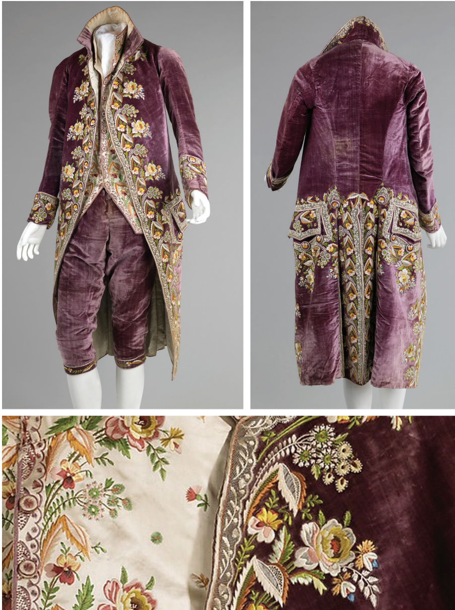
French court suit (c.1810) by an unknown designer silk velvet with silk thread embroidered detail

12. Analyse the following elements of this suit: