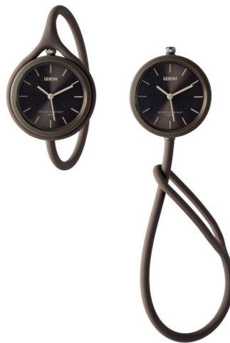
Watch (2010) designed by Mathieu Lehanneur plastic and silicon

11. Analyse the following elements of this watch design: