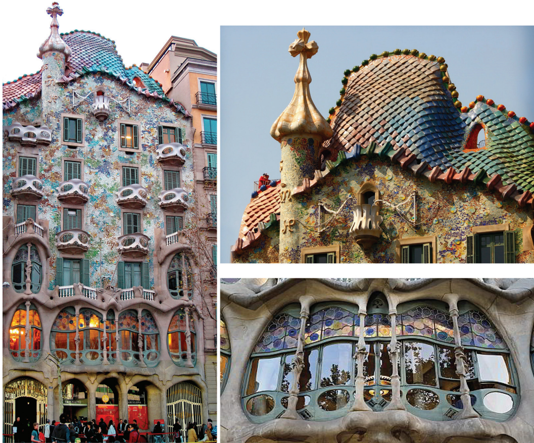
Casa Batlló (redesigned 1904) by Antoni Gaudí sandstone, plaster, coloured glass, pottery, ceramic mosaic, iron and stained glass

10. Analyse the following elements of this architectural design: