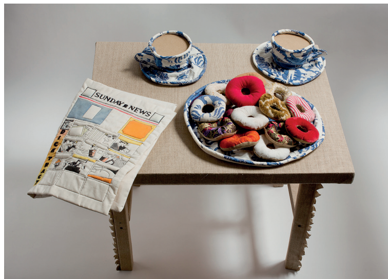
Doughnuts, Coffee Cups and Comics (1962) by Jann Haworth 3D artwork with objects made from stitched fabric (life-size)

4. Analyse the following elements of this 3D artwork: