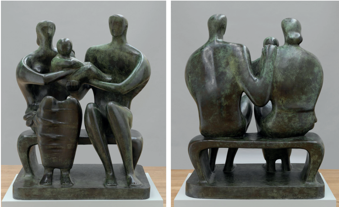
Family Group (1948-49) by Henry Moore bronze sculpture (145 x 118 x 70cm)

5. Analyse the following elements of this sculpture: