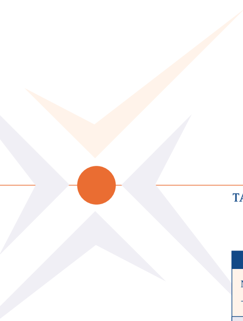
TABLE NH7: TREND IN APPEALS AND THEIR SUCCESS AT NEW HIGHER, 2000 TO 2001