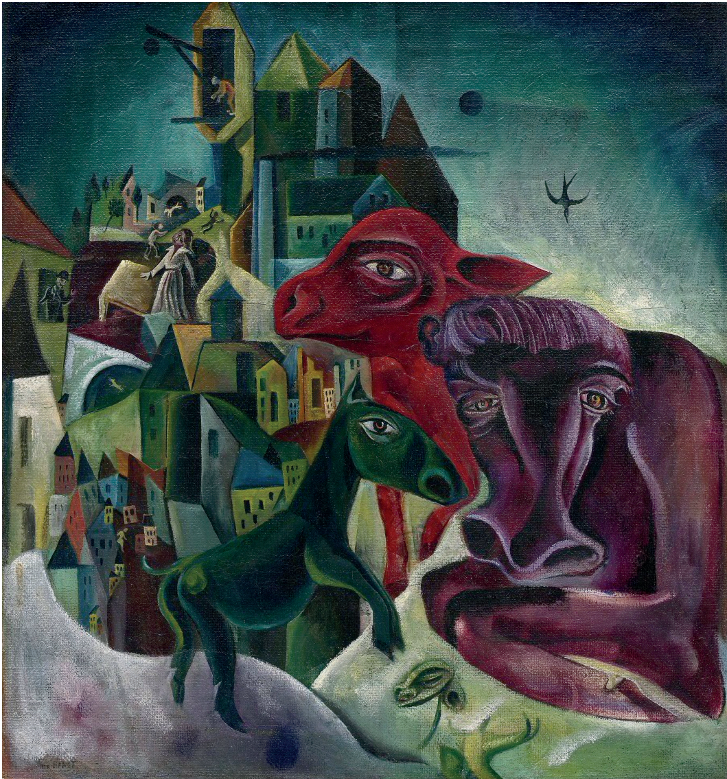
City with Animals (1919) by Max Ernst oil paint on canvas (67 × 63 cm)

3. Comment on this painting, referring to: