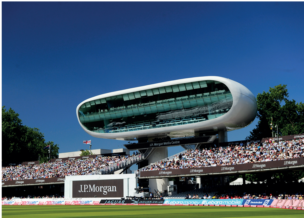
JP Morgan Media Centre (1999), Lord's Cricket Ground, designed by Future Systems materials: aluminium and glass

10. Comment on this design for a media centre, referring to: