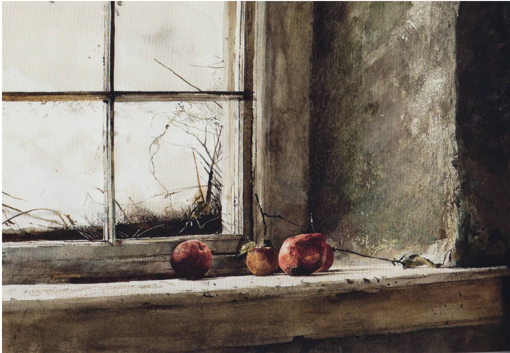
Frostbitten (1962) by Andrew Wyeth watercolour on paper (41 × 60 cm)

2. Comment on this painting, referring to: