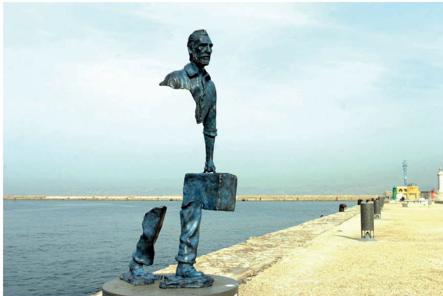
The Traveller (2013) by Bruno Catalano bronze – life size

4. Comment on this sculpture, referring to: