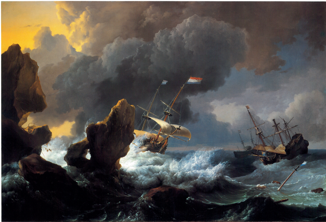
Ships in Distress off a Rocky Coast (1667) by Ludolf Backhuysen oil paint on canvas (114 × 167 cm)

6. Comment on this painting, referring to: