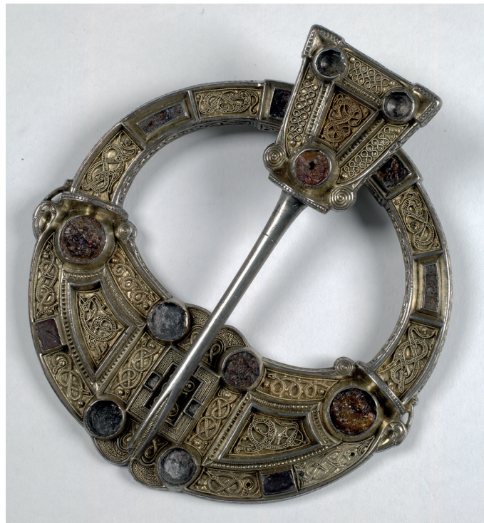
The Hunterston Brooch (c.700 AD) by an unknown designer materials: silver and gold with semi-precious stones (now missing)

11. Comment on this brooch design, referring to: