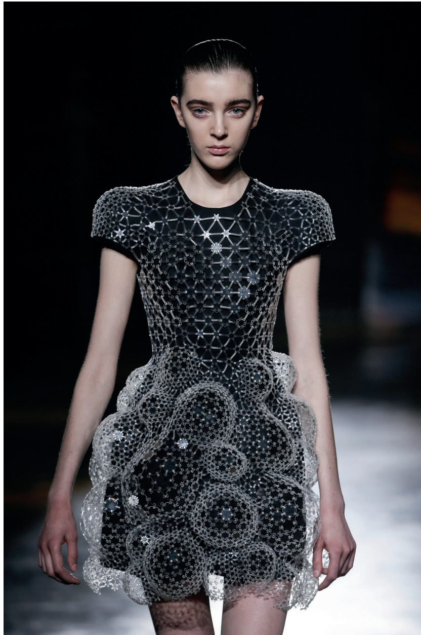
Lucid A/W Collection (2016) by Iris Van Herpen Materials: lasercut transparent elements, flexible tubing

12. Analyse the following elements of this fashion design