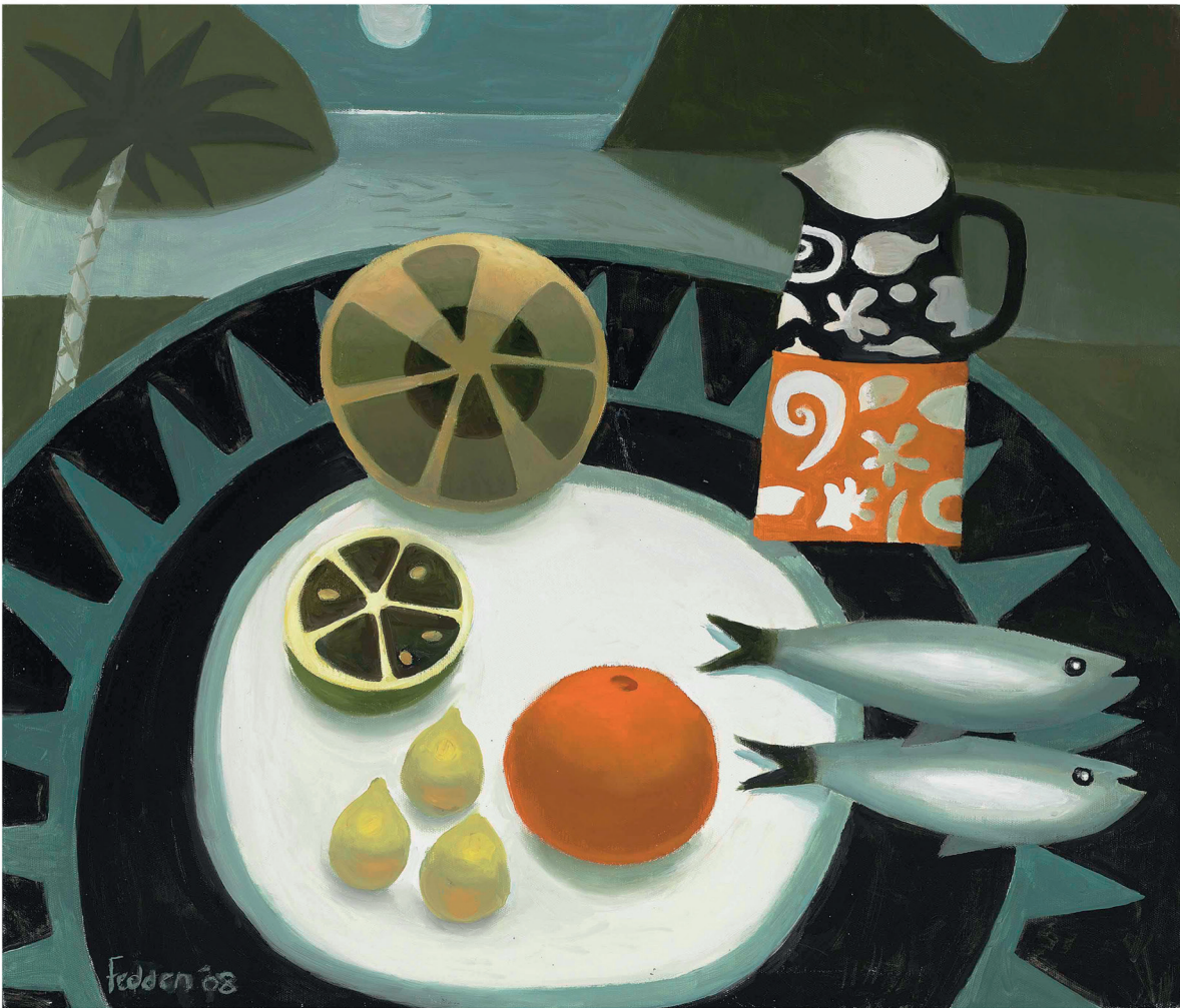
Charlotte's Jug (2008) by Mary Fedden