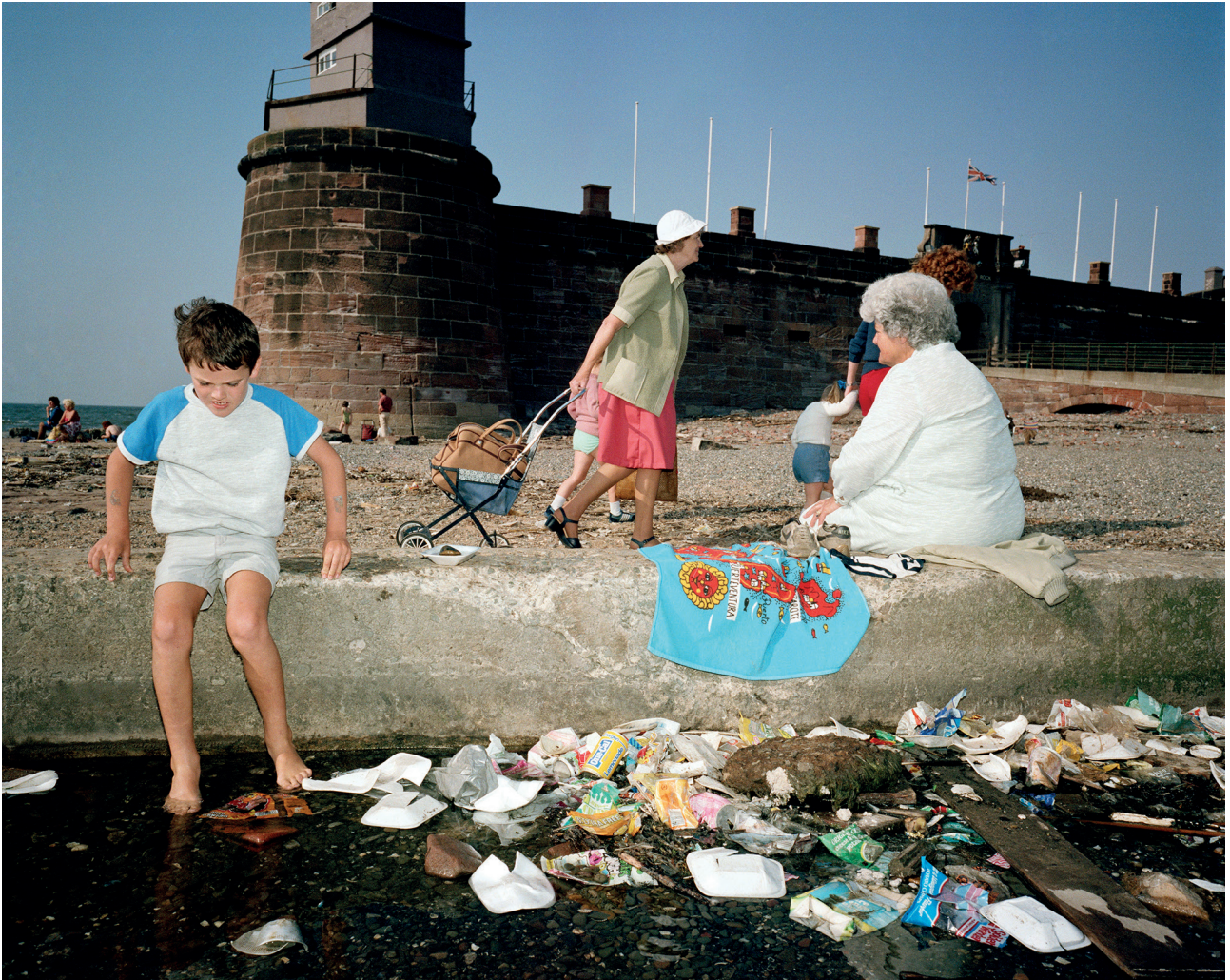
New Brighton from The Last Resort series (1985) by Martin Parr