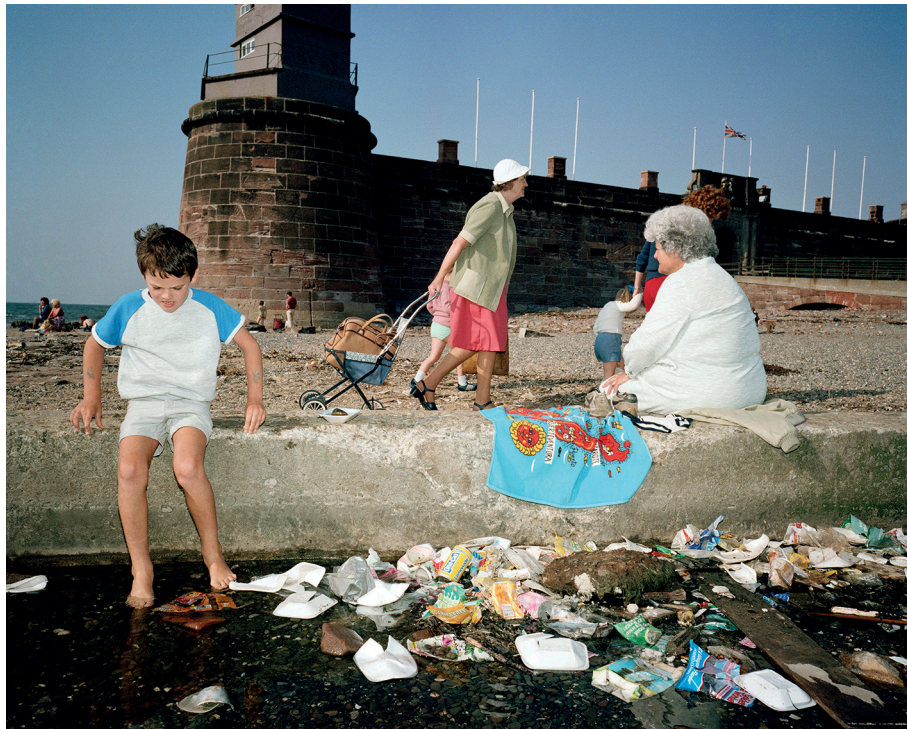
New Brighton from The Last Resort series (1985) by Martin Parr

Refer to this image on the supplementary sheet when answering question 12.