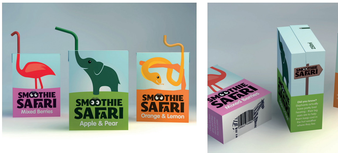
‘Smoothie Safari’ drink carton with straw (2012) by Luke Thomson

8. Comment on this packaging design, referring to: