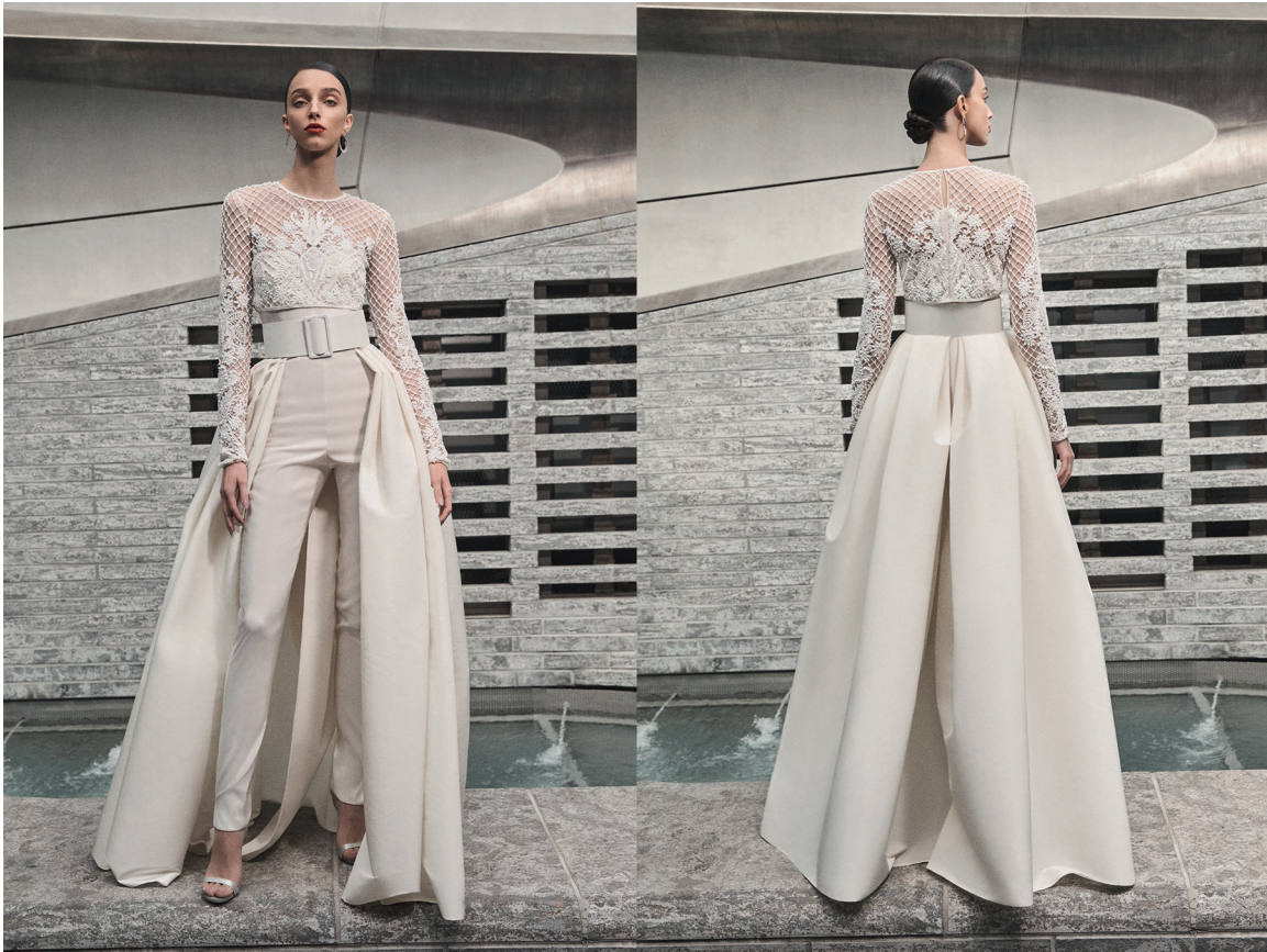
Bridal jumpsuit with detachable belted skirt (2019) by Naeem Khan Materials: silk, lace, embroidered details and crystal beads

12. Comment on this bridal outfit, referring to: