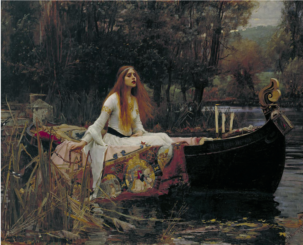
The Lady of Shalott (1888) by John William Waterhouse Oil paint on canvas (153 x 200 cm)

4. Comment on this painting, referring to: