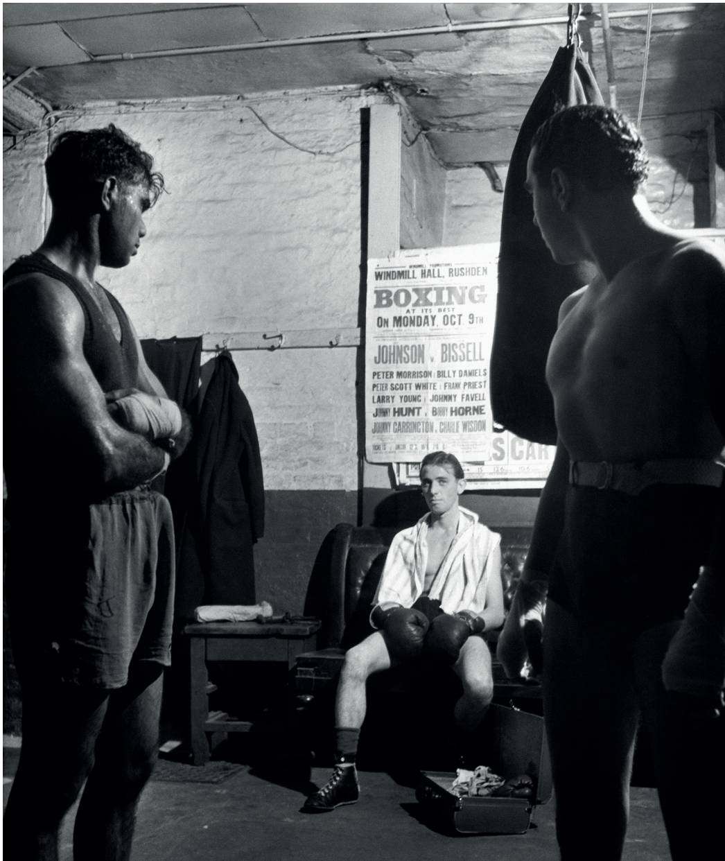
Boxing (1950) by Robert Doisneau