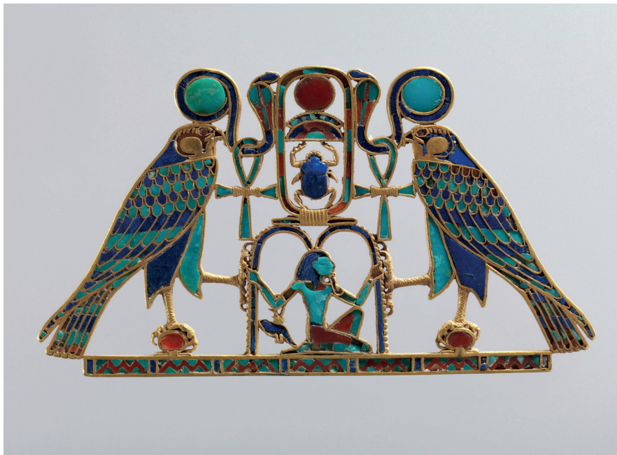
Detail of pendant

Ancient Egyptian Necklace (approximately 4000 years old)