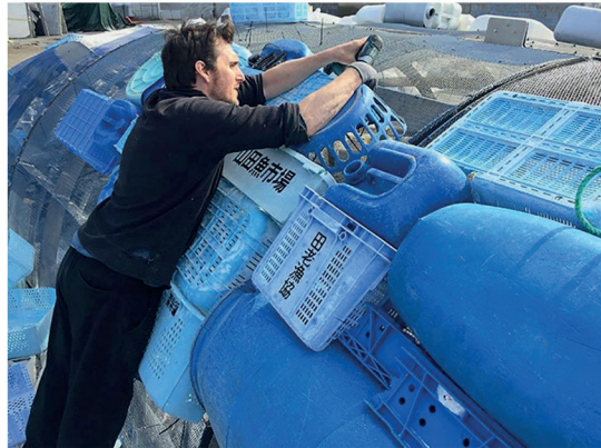
Sculpture during construction