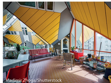
Cube Houses, Rotterdam (1977) by Piet Blom