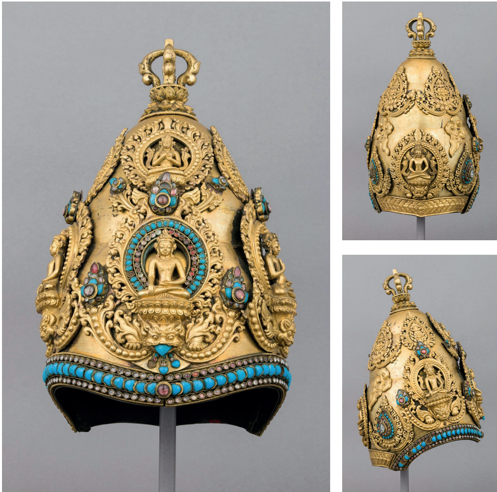
Vajracarya Priest's Crown (15-16th century) by unknown designer, Nepal Materials: copper, gold, turquoise, semi-precious stones, silver foil height 34 cm, weight 2.3 kg

12. Analyse the following elements of this headpiece design: