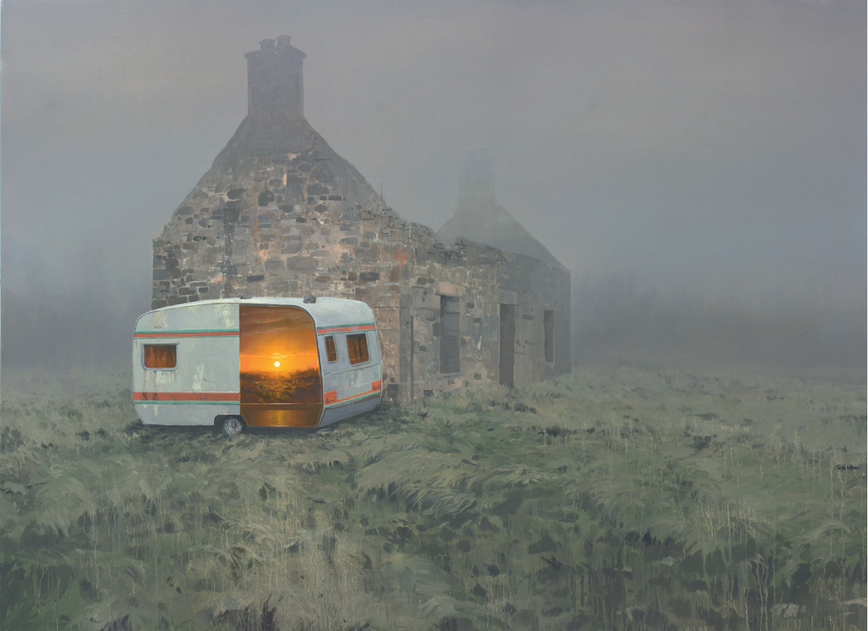
Merlin (2016) by Andrew McIntosh oil paint on linen (150 x 110 cm)

5. Analyse the following elements of this painting: