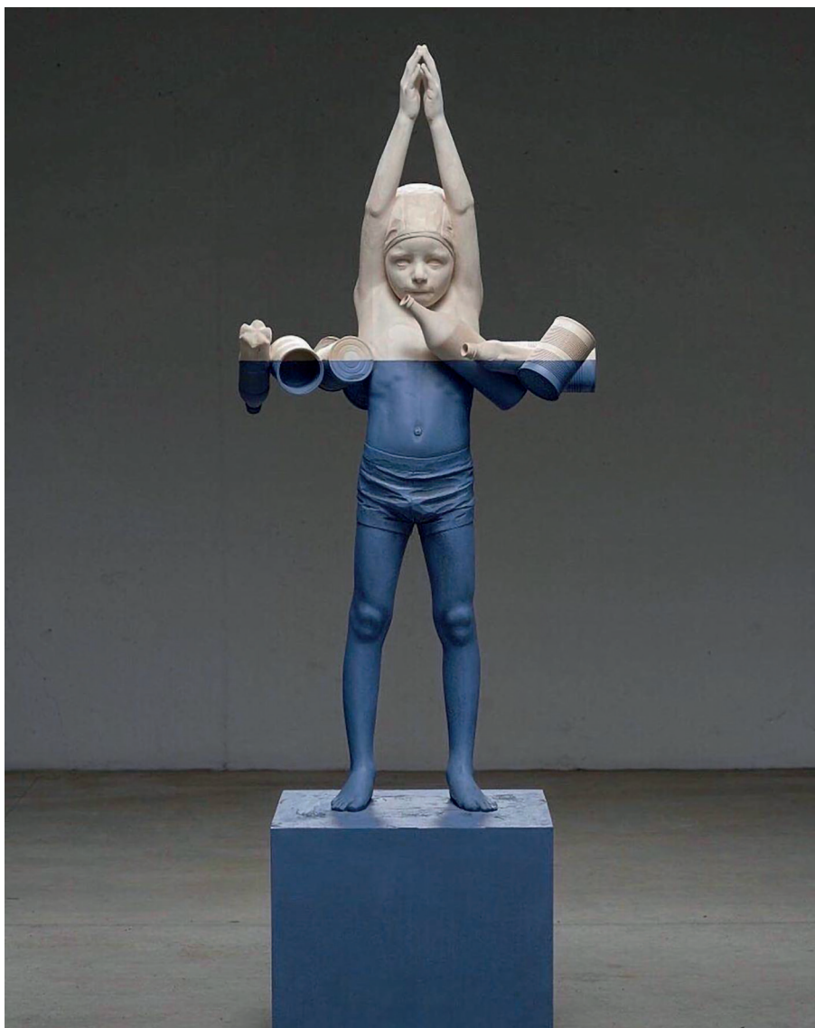
The Boy and the See (2019) by Willy Verginer wood and acrylic paint (193 x 68 x 50 cm)

2. Analyse the following elements of this sculpture: