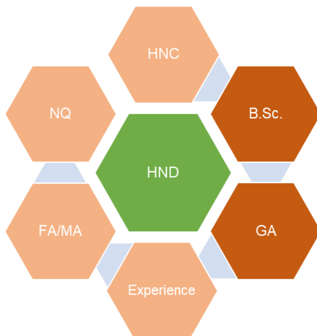
Figure 2: Entry and exit points

A number of entry and exit points exist. Figure 2 illustrates the most common entry and exit points.