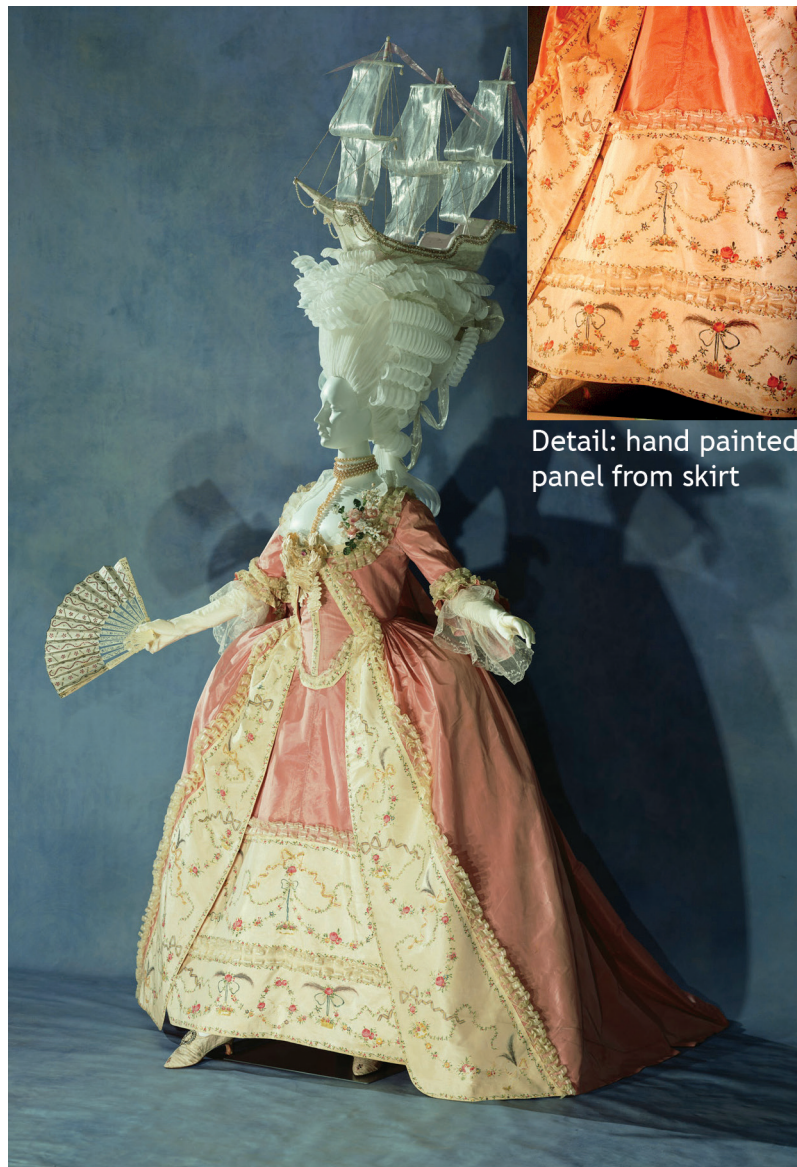
Detail: hand painted panel from skirt