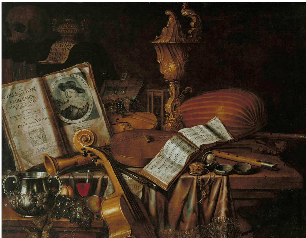
Still Life (1696) by Edward Collier