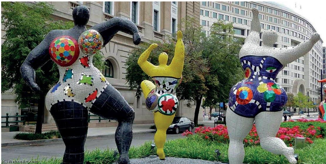
The Three Graces (1999) by Niki de Saint Phalle Fibreglass and mosaic (ranging in height from 3.7 to 4.6 m)

5. Comment on these sculptures, referring to