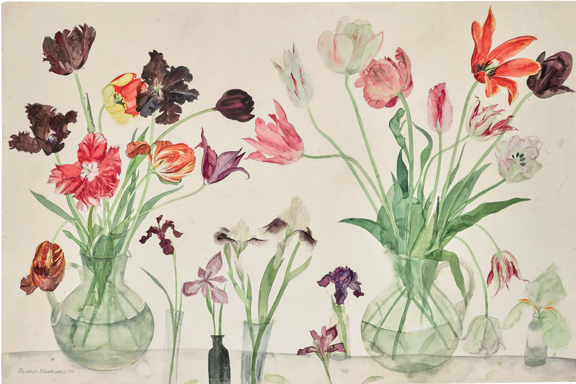
Tulips and Irises (1990) by Dame Elizabeth Blackadder