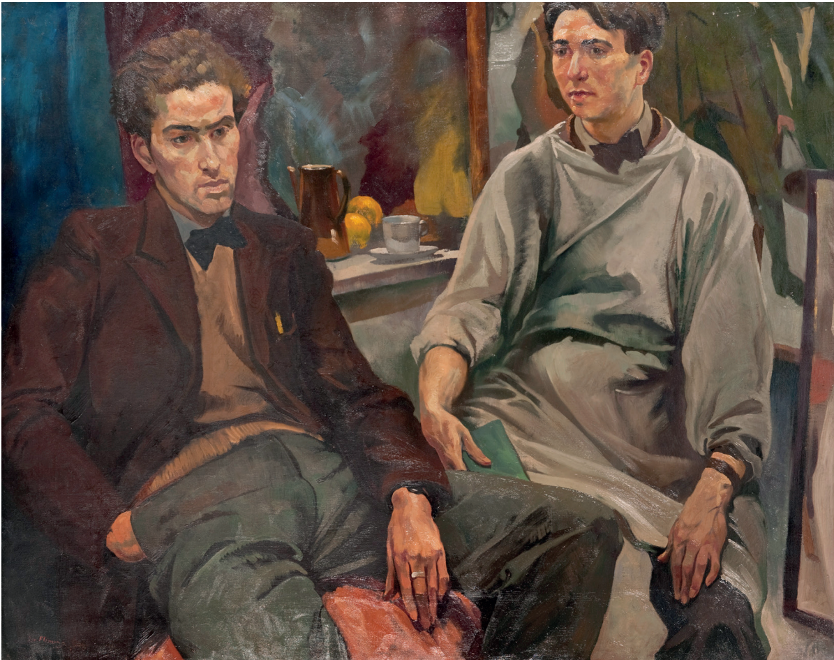
The Two Roberts (1937–38) by Ian Fleming Oil paint on canvas (102 x 127 cm)

3. Comment on this painting, referring to