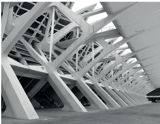
Prince Felipe Science Museum, Valencia (2003) by Santiago Calatrava