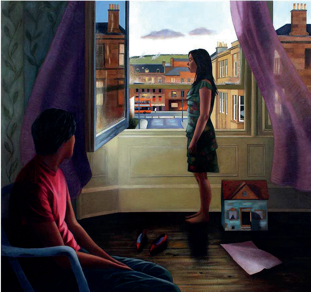
The Doll's House (2007) by Lesley Banks