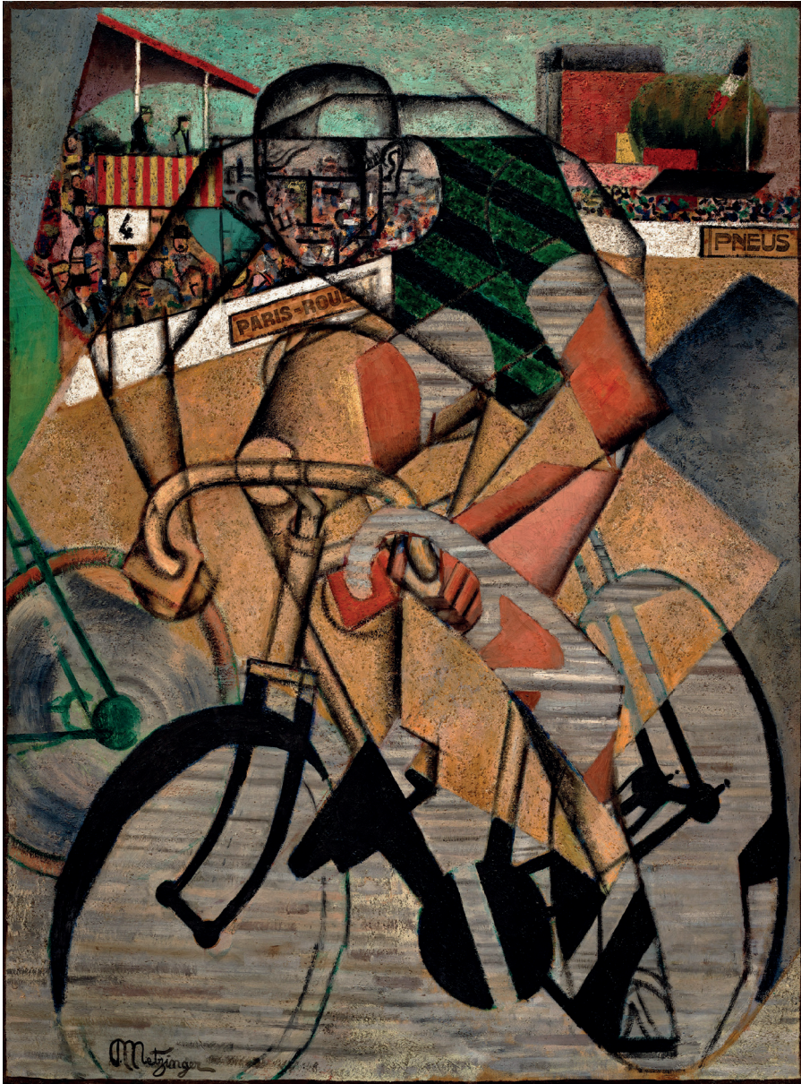
At the Cycle-Race Track (1912) by Jean Metzinger Oil paint and collage on canvas (130 x 97 cm)

4. Comment on this artwork, referring to