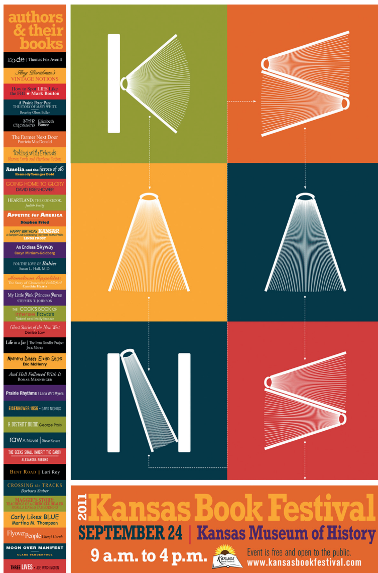
Kansas Book Festival poster design (2011) by an unknown designer

8. Comment on this poster design, referring to