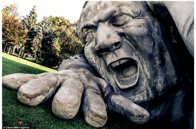
Popped Up (2014) by Ervin Loránth Hervé