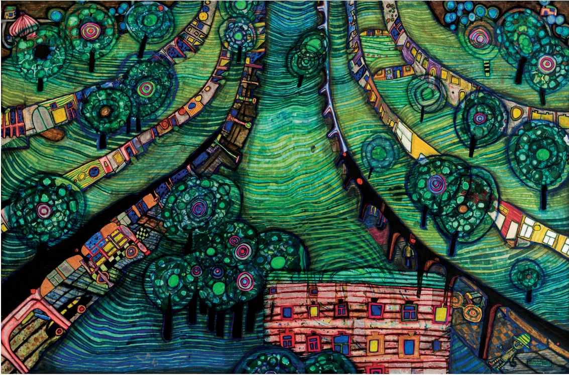
Green Town (1973–1978) by Friedensreich Hundertwasser Watercolour and oil paint on paper (97 x 145 cm)

6. Comment on this painting, referring to