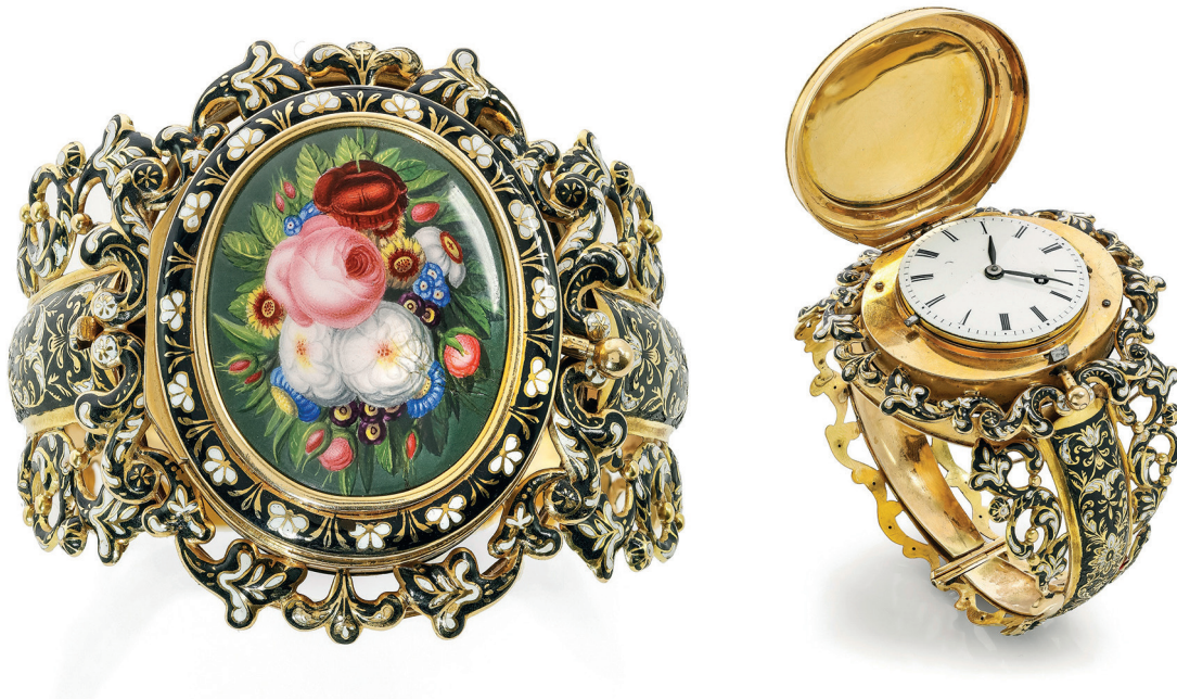
Gold and enamel bracelet with concealed watch (c.1830) by Moricand and Desgrange

9. Analyse the following elements of this jewellery design