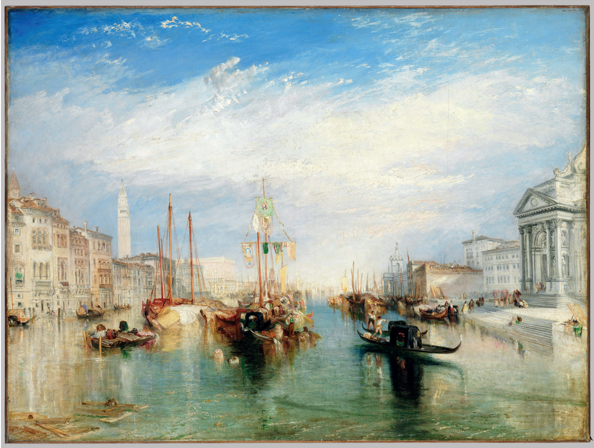
Venice, from the Porch of Madonna della Salute (c.1835) by JMW Turner