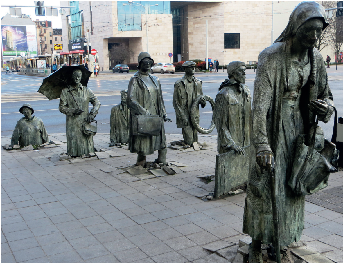
The Anonymous Pedestrians (2005) by Jerzy Kalina Bronze cast figures (life-size), Wrocław Poland

6. Analyse the following elements of this sculptural work