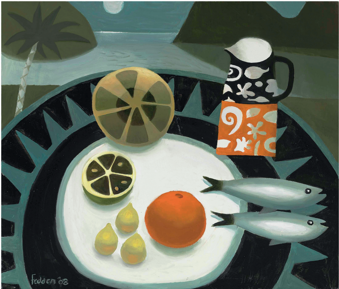
Charlotte's Jug (2008) by Mary Fedden