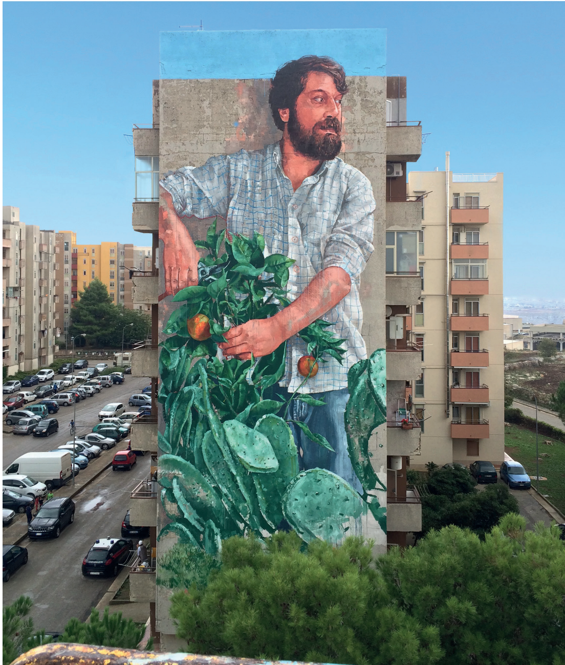
The Gardener (2016) by Fintan Magee Acrylic paint on concrete, Ragusa Italy

5. Analyse the following elements of this artwork