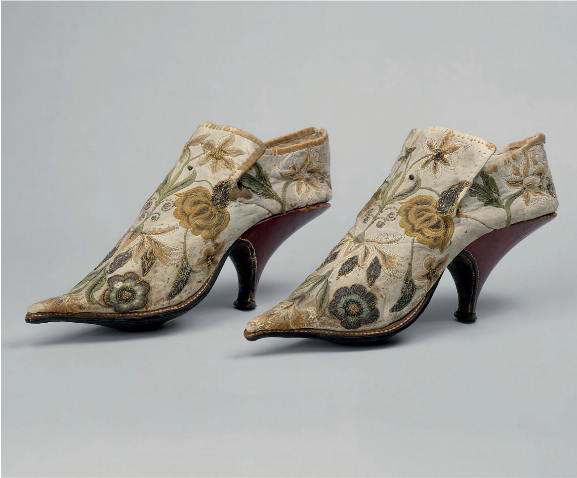
Fashion Shoes (17–18 th century) by unknown designer, France Materials: silk, leather

12. Analyse the following elements of this shoe design: