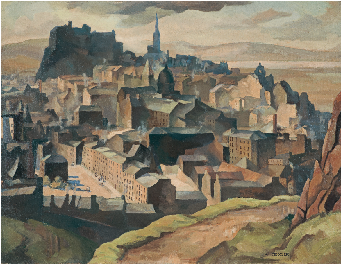
Edinburgh (from Salisbury Crags) (c. 1927) by William Crozier oil paint on canvas (71 × 92 cm)

4. Analyse the following elements of this painting: