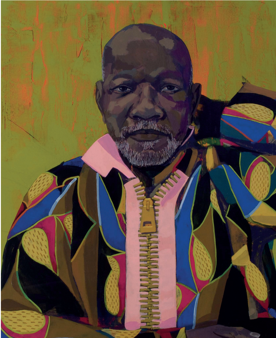
Self Portrait (2016) by Kerry James Marshall acrylic paint on panel (48 × 44 cm)

6. Analyse the following elements of this painting: