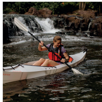
Beach LT Origami Kayak (2021) by Oru Kayak

Materials: double layered corrugated thermoplastic polymer, neoprene, canvas straps unfolded (368 × 74 × 61 cm), folded (84 × 31 × 74 cm), weight 11.3 kg