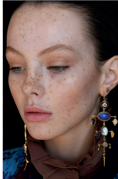
Victorian-Style Drop Earrings (c.2023) by Grainne Morton

Materials: ethically sourced 18 carat gold-plated silver, recycled materials including antique enamel button and cameo, vintage semi-precious stones, mother of pearl, shell, and glass length 10 cm, width 4 cm