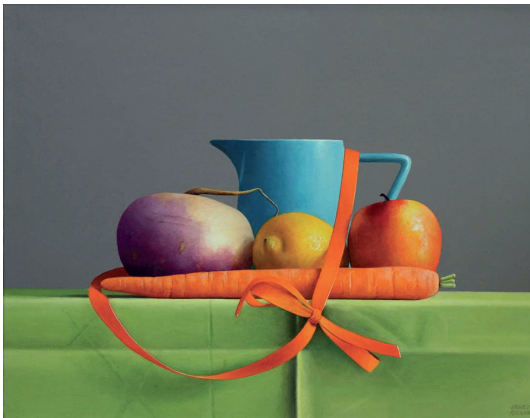
The Gift (2010) by Janet Rickus oil paint on panel (36 × 46 cm)

2. Analyse the following elements of this painting: