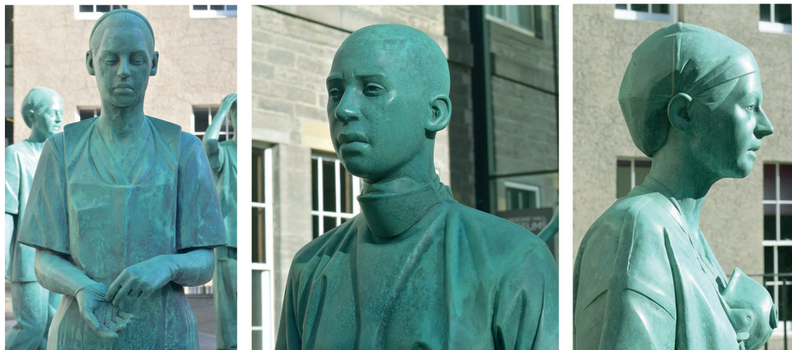
Your Next Breath (2022) by Kenny Hunter bronze (life-size)

5. Analyse the following elements of this sculpture: