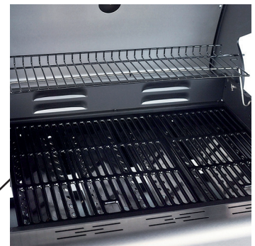
Barbecue with lid open